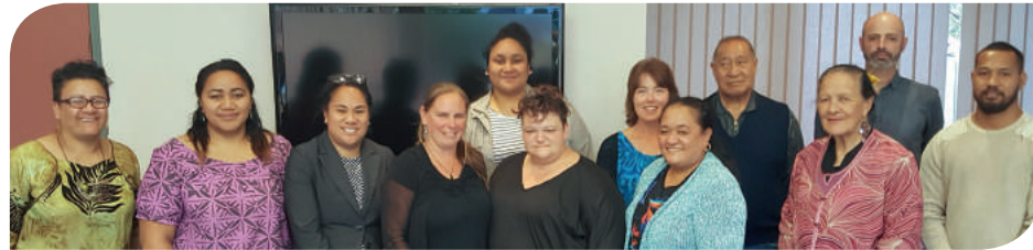
Pasefika Money Mates participants and tutors from the course completed in March 2018

Our budgeting and financial literacy services complements the range of services provided by Family Works. These are all focused on helping people to make positive and lasting changes in their lives.